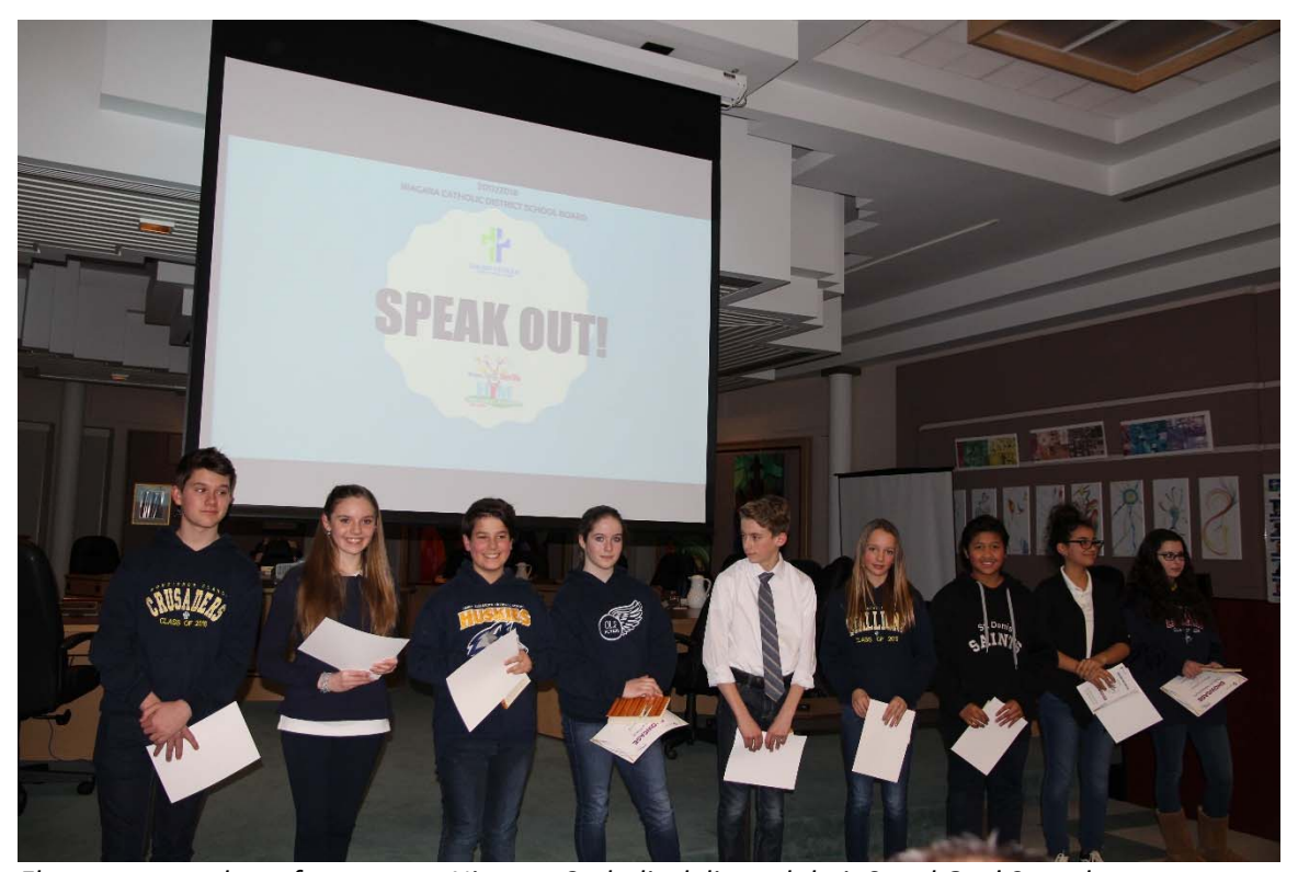
Elementary students from across Niagara Catholic delivered their SpeakOut! Speeches to trustees, Senior Staff and guests before the March 6 Committee of the Whole Meeting.